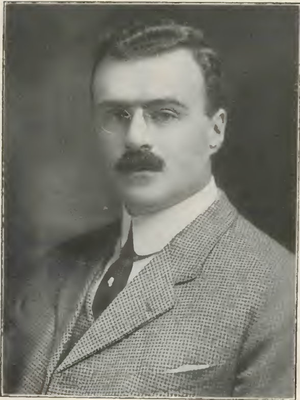
MR. J. BUTLER WRIGHT