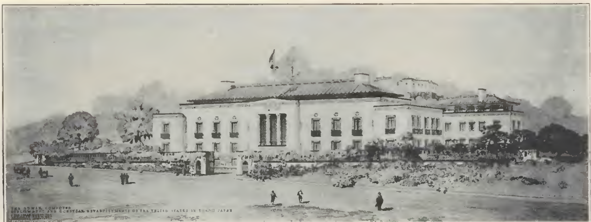
Diplomatic and Consular Establishments of the United States, Tokyo, Japan. Architect's drawing; view looking towards proposed Ambassador's residence