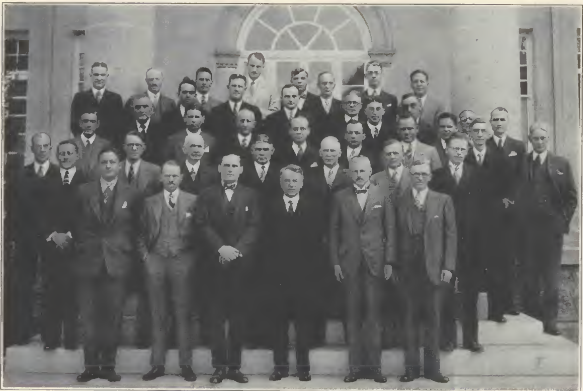
CONSULAR CONFERENCE IN MEXICO CITY