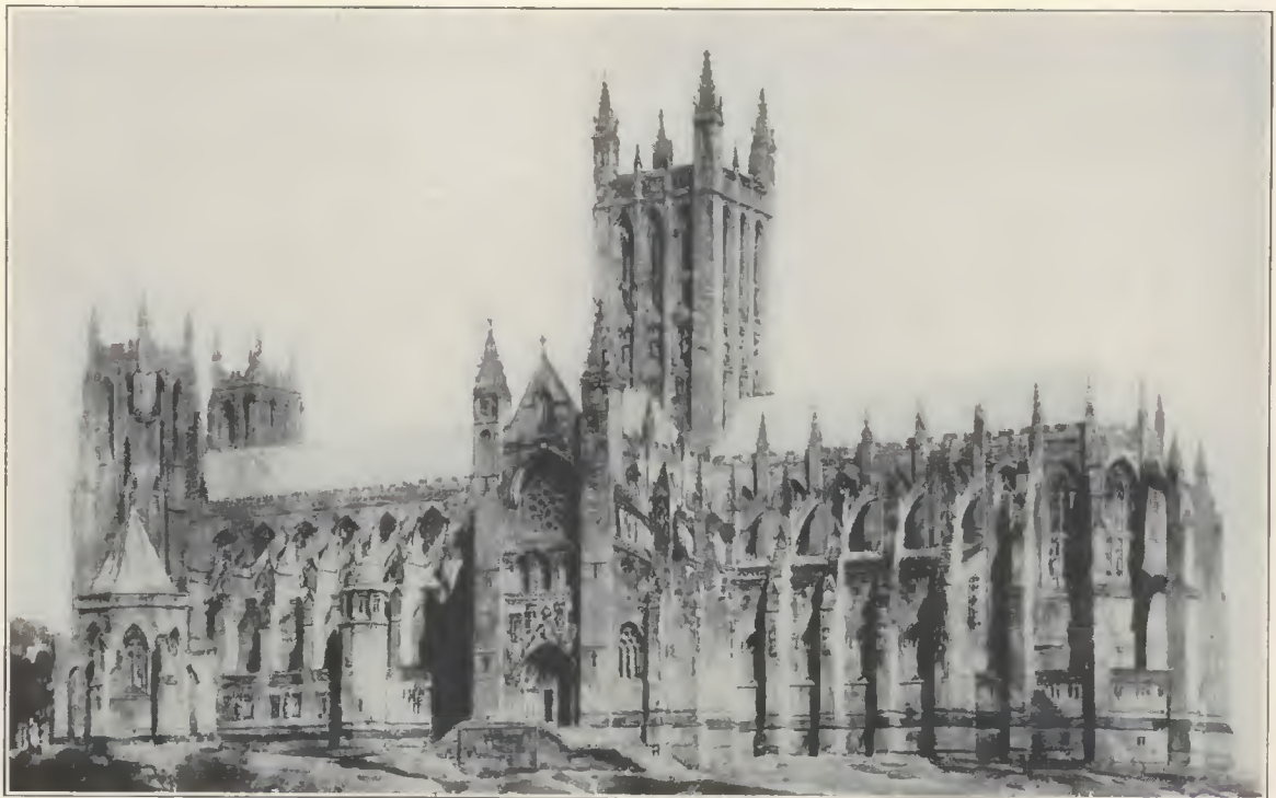
WASHINGTON CATHEDRAL AS IT WILL APPEAR WHEN COMPLETED

In addition to the great central church, the Washington Cathedral project calls for some 30 auxiliary buildings to house institutions all held essential to the complete program of nation-wide