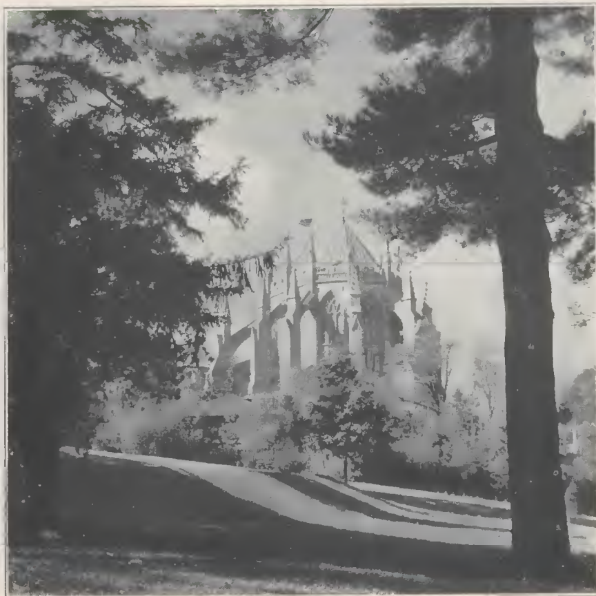
WASHINGTON CATHEDRAL. The Apse, or Eastern Exterior