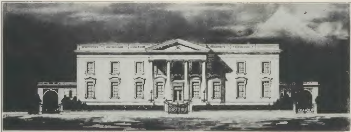
AMERICAN CONSULATE, YOKOHAMA, JAPAN (Architect's Drawing)