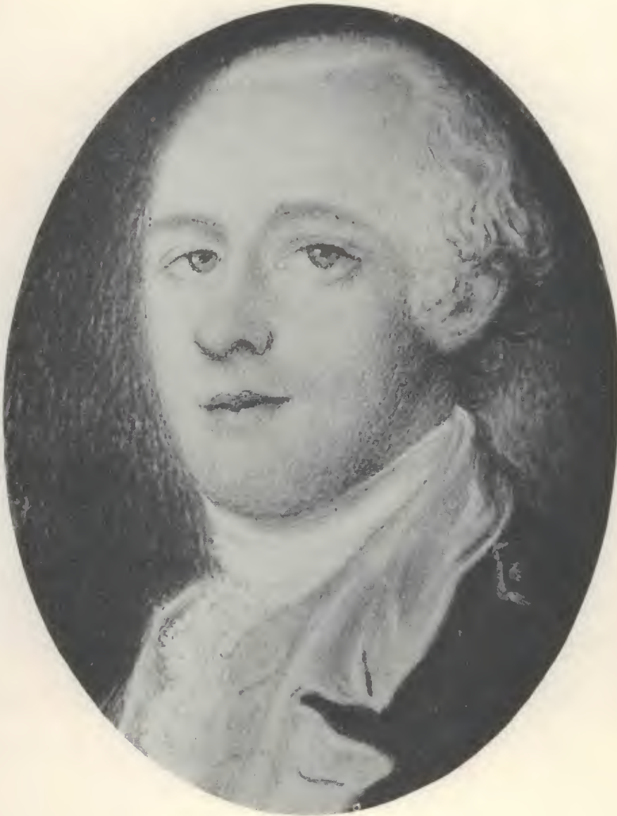
COLONEL WILLIAM PALFREY