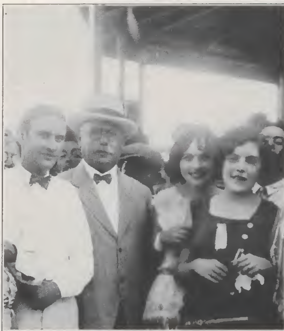
GENERAL OBREGON At a Fiesta in his honor at Miramar

My own recollections of Guaymas include several of the brave General Obregon. He was royally entertained by the people of Guaymas twice during my tour of duty. His cheery smile and sangfroid under trying circumstances endeared him even to his political opponents. At one stag entertainment, a typical Mexican rancho luncheon, he was in rare good form. The last time I saw him was about a week before his assassination. It was on the Bacochibampo (snake in the grass by the water) Beach. There he sang picturesque Mexican corridos the while he was not entertaining the ladies to whom he was ever charming. As a warrior and politician he was well known but few realized, except on the West Coast of Mexico, that he was a Mexican Stinnes. Among his many activities were the farming of thousands of acres, maintenance of two agricultural experiment stations, promoting the growth of cotton, peas, chick-peas, henequen-castor oil beans, and what not, the operation of two flour mills, a rice mill, a battery factory, large scale grain speculations, banking, selling automobiles and lumber, and running a cannery and soap factory—just for a starter.