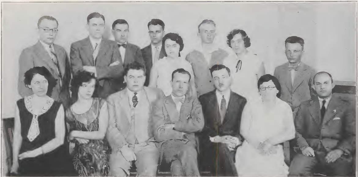
STAFF OF AMERICAN LEGATION-CONSULATE, KAUNAS, LITHUANIA