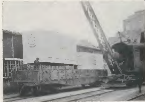
Security (Steel) Vans, Available throughout the World. Safe, Economical.

Coming out of Russia, after two years of service there, an American sought the assistance of American Consuls at two of our posts in the Baltic States. On March 4, 1933, he wrote the Department regarding the kindly help and assistance afforded in his need, and the last paragraph of his letter read as follows: "I cannot help sending this to express appreciation of the American Consular Service and the deeper understanding it gives me of my identity as an American citizen. I feel a stronger, warmer loyalty to the government of my people."