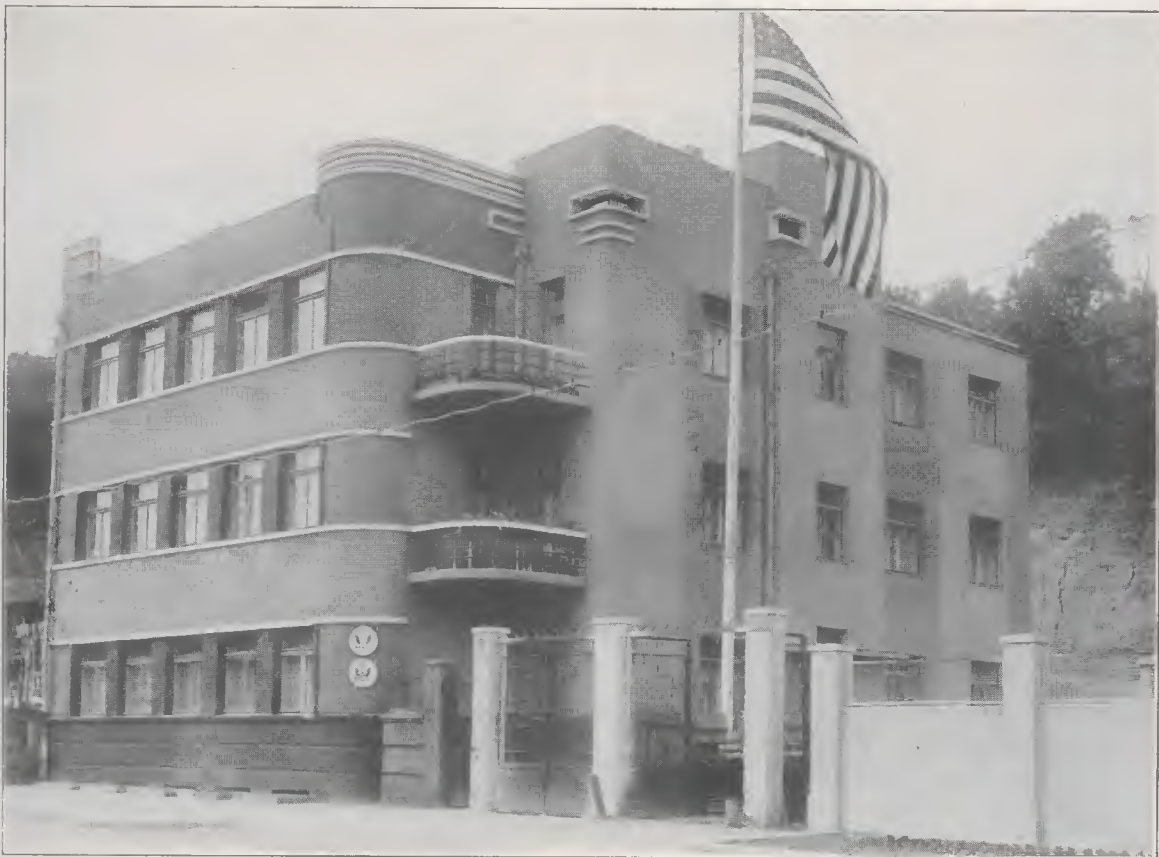
THE NEW LEGATION-CONSULATE AT KAUNAS (Occupied November 4, 1930)

Knights at the first battle of Tannenberg some 500 years ago. There are some who say that the country commenced its decline then, that the new religion suited neither the climate there nor the temperament of the people. Be that as it may, there is perhaps some old pagan quality left up there—a stubborn will to be free. With progressive ideals and a population brought up on simplicity, but generous to a degree, whose native diffidence is sometimes mistaken for aloofness, Lithuania has many of the qualifications for endurance and success. Its republican Government has an internal debt not exceeding $500,000 and owes about $6,000,000 abroad—chiefly to the United States. Were it not for its lack of minerals—its principal difficulty is that it has no coal or petroleum—Lithuania could probably shut its doors to the outside world tomorrow and live off its land. Educational opportunities, which were almost nonexistent under the former Imperial Russian