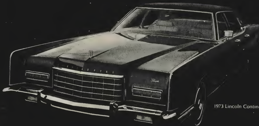
1973 Lincoln Continental