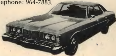
1973 Ford LTD Brougham

In the New York area, contact Diplomatic Sales, Ford Export Corporation, Ford Motor Company, 153 Halsey Street, Newark, N.J. 07102. Telephone: 643-1900. From New York, telephone: 964-7883.