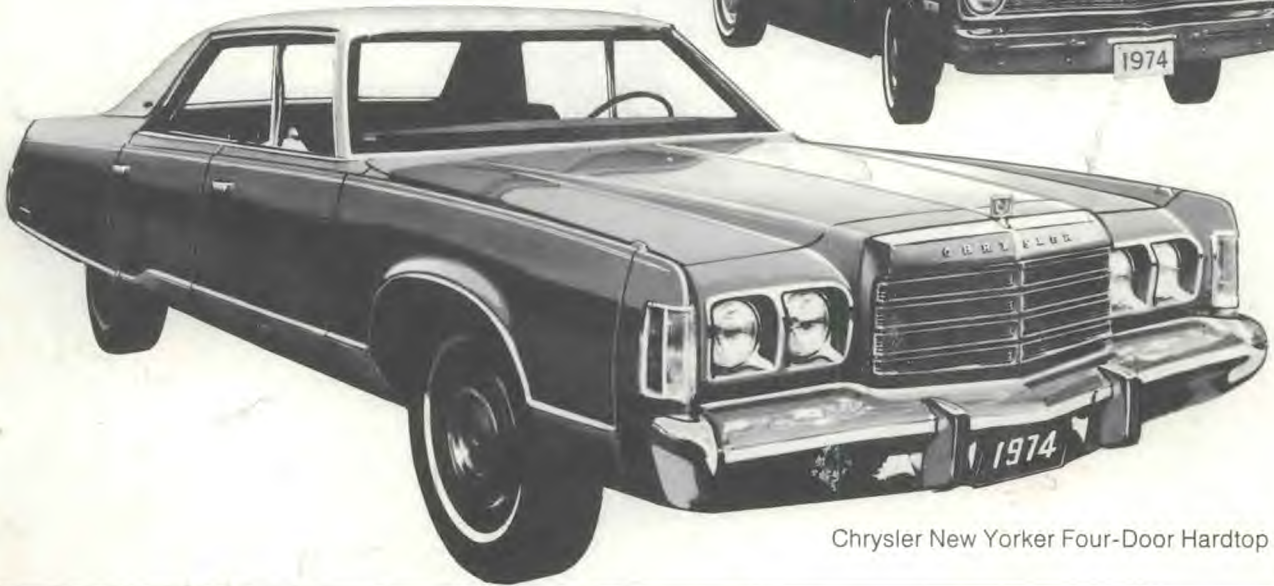
Chrysler New Yorker Four-Door Hardtop