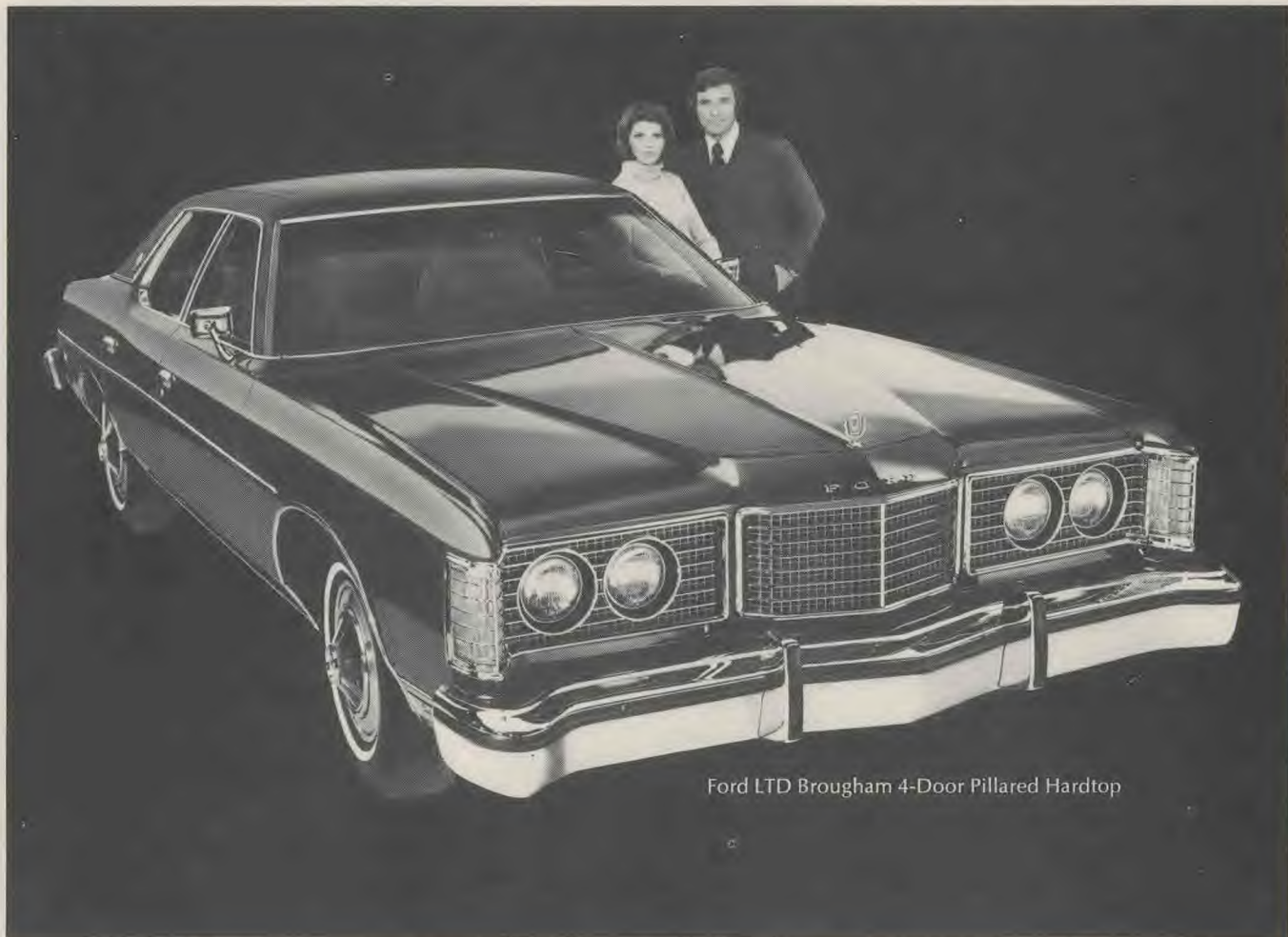
Ford LTD Brougham 4-Door Pillared Hardtop