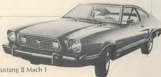
Ford Mustang II Mach 1