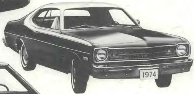
Dodge Dart Swinger