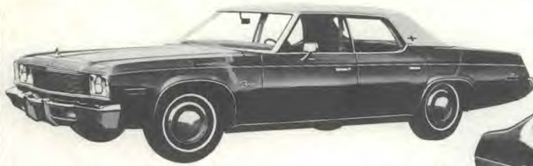
Plymouth Fury Gran Sedan Four-Door Hardtop